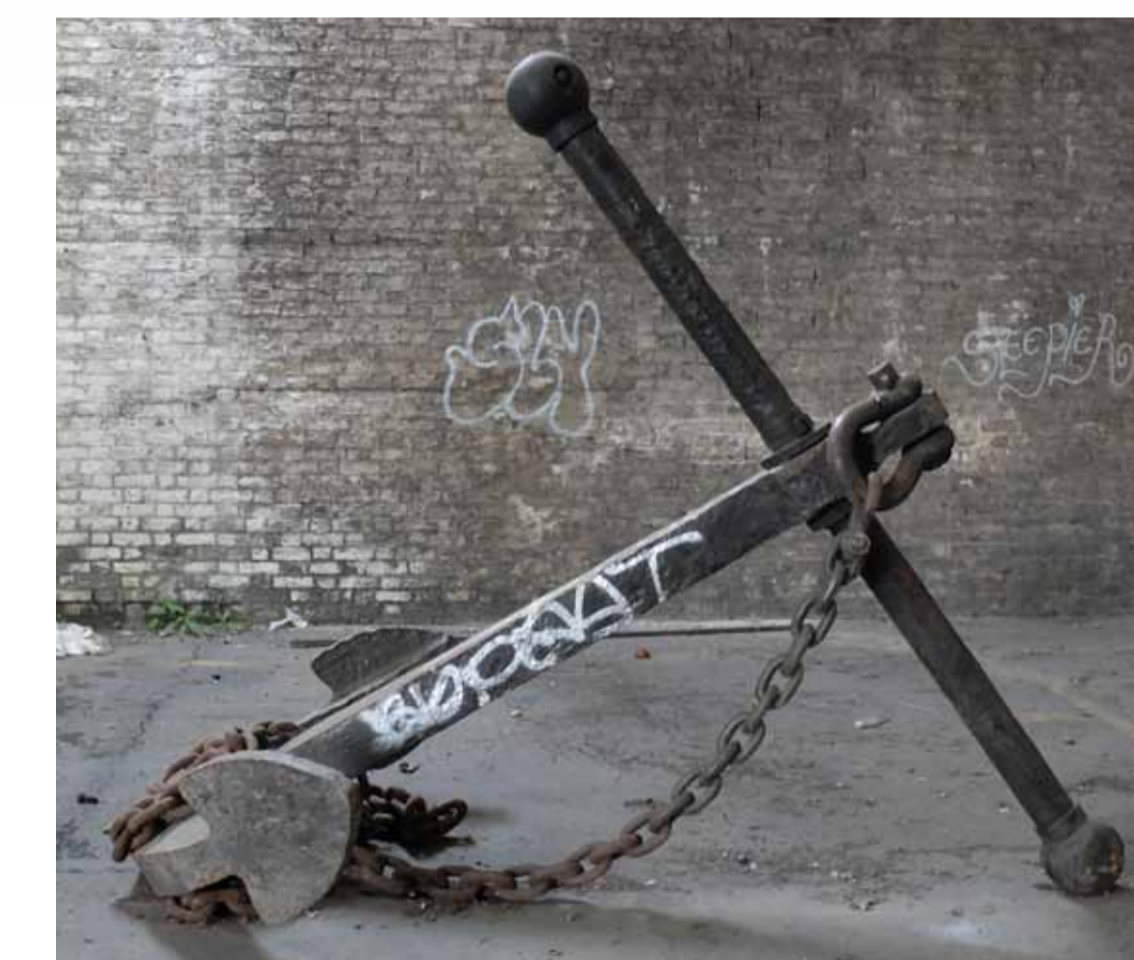
The anchor, currently at Convoys Wharf