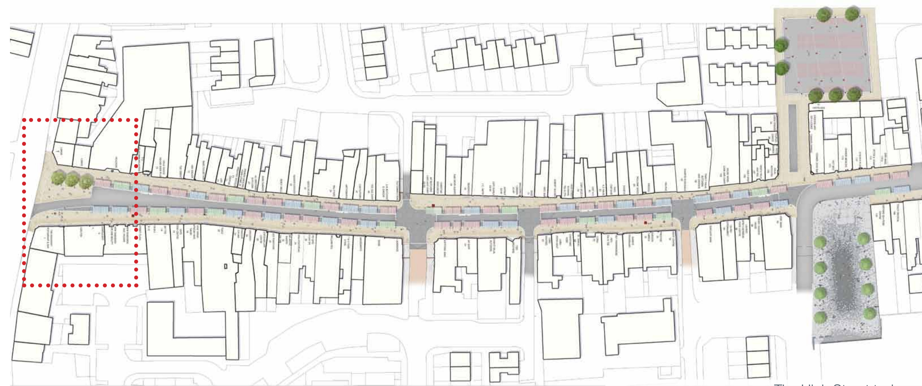
The High Street today